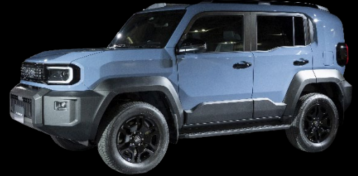
*Image shows prototype model.

“I believe the Land Cruiser FJ tightly condenses the Land Cruiser spirit and allows you to directly experience the joy of off-road driving.”