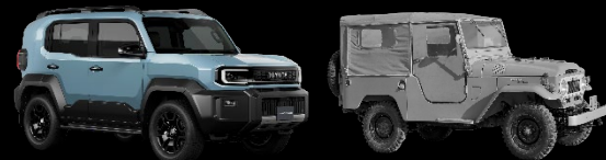
▲ Land Cruiser “FJ” (left: prototype) FJ40 Land Cruiser (right)