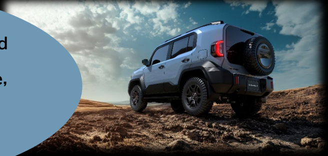
*Image shows prototype model.

The new model, the Land Cruiser "FJ," has been developed as a Land Cruiser with a different size to support various regions. Of course, its size also makes it perfectly suited to Japan's roads. Please look forward to a car full of the Land Cruiser spirit!