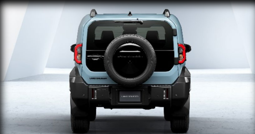
*Image shows prototype model.