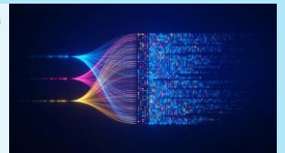
Mathematical and Data Sciences