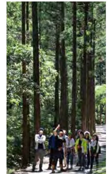
A hands-on forest program (a walk-through a 100-year forest)