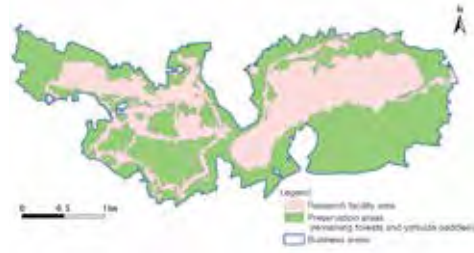
Overall diagram of the new Toyota R&D Center

Toyota is constructing a new research and development facility in the overlapping area of Toyota City and Okazaki City. This new facility will be a hub for development of sustainable next-generation mobility. The main design concept is a technical center in harmony with nature and local communities. About 60 percent of the total project site will be preserved as areas for the regeneration of forests and management of yatsuda rice paddies (paddies in low-lying areas) in collaboration with the local community. Toyota is also actively sharing information including the status of these activities and findings gained from them.