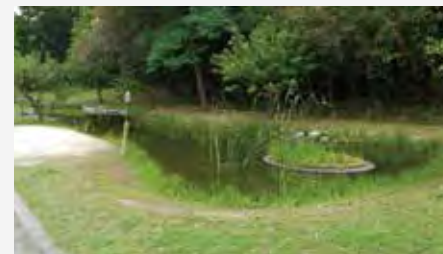
The Kinuura Nature Observation Park, a biotope at the Kinuura Plant

Toyota will continue to undertake plant afforestation with the aim of maintaining and improving the habitat environments of living creatures in order to create a plant that makes use of and is in harmony with nature.