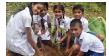
Trees are planted with a focus on native species

The program provides practical training on tree planting starting with growing saplings mostly by younger generation, and environmental education. Before trees are planted, local residents cooperate with ground preparation and hole digging, and the wholehearted efforts of the children inspire the adults, leading to the development of activities that involve entire regions, and there have been reports of the expansion of voluntary activities as well.