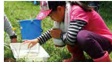
Observation of captured living creatures

In July 2017, we conducted a survey of the living creatures in rice paddies. We used landing nets and plastic bottle traps to capture living creatures in three kinds of waterside areas with different environmental conditions: rice paddies (with agricultural chemical use), biotope (without agricultural chemical use), and waterways. We examined the species and numbers living in each environment and compared the differences. Participants learned from explanation by an expert that there is a relationship between the living creatures living in rice paddies and surrounding forests, and when living creatures decrease due to changes in the environment, food chains collapse, and ultimately there is an impact on human food supplies.