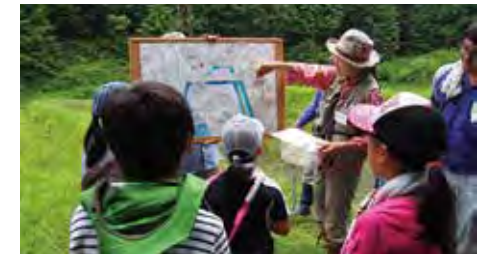
Explanation by an expert