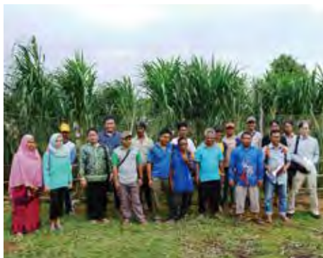
Program participants with Napier grass three months after cultivation

In the future, we will confirm the effectiveness of selected developed varieties and cooperate with local companies to verify effectiveness on a practical scale such as expanding self-sustaining models to other rural villages.