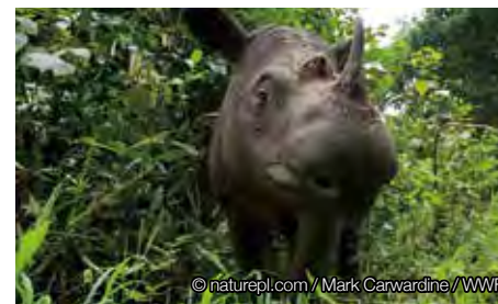
It is believed that there are no more than 100 Sumatran rhinoceroses

■ FY2018 Activities (2): A website for the Living Asian Forest Project in both Japanese and English was launched in November 2017. The site introduces a summary of the project as well as information on recent activities, plants and animals inhabiting the living Asian forests.