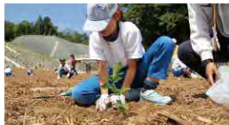
Children planting saplings grown from acorns

In June 2017, Toyota held a tree planting activity with the participation of 90 prefectural and municipal personnel and others local concerned persons including fifth and sixth grade students and teachers from the Hanayama, Tomoegaoka, and Onuma Elementary Schools in Toyota City and the Shimoyama Elementary School in Okazaki City. The saplings, grown at elementary schools in milk packs, were raised from konara oak and Japanese blue oak acorns collected on the business site. On the day of the event, a total of 600 saplings were planted. By growing saplings from collected acorns and returning them to the mountain, we are preserving acorn mountain. The Karen Forest Development Promotion Association, a member organization of the Shimoyama Satoyama Conference, plays a central role in this program, and Toyota employees participate as volunteers each year. We will continue to support local proactive activities that lead to the preservation of Satoyama and will take measures to make the new R&D facility a sustainable technical center in harmony with nature and local communities.