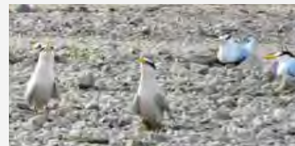
Little terns (the two on the left) and decoys (two on the right)

In FY2017 decoys were installed, CDs of the birds' cries were played, and other activities were conducted at the Kinuura Plant. It was confirmed that little terns flew into the area, but unfortunately, they did not build nests. Starting in March 2018, employees created gravel beds, drinking locations, and hiding spots for chicks and conducted other activities to improve the nesting environment and set additional decoys to attract more birds. As a result, birds built nests and laid eggs, and the chicks are now steadily growing as of July 2018.