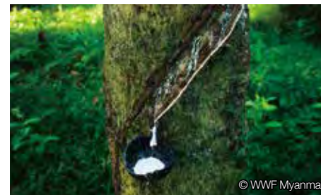
Rubber is produced by making a cut near the surface of a rubber tree using a knife or other tool, collecting the white sap that seeps out, and solidifying and processing it