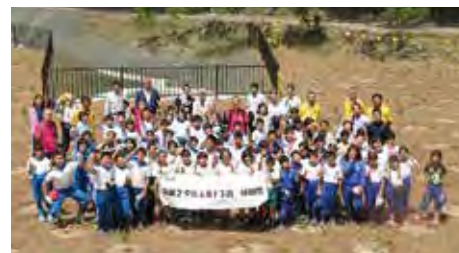
Personnel from schools, local government, and the local community at the tree-planting event