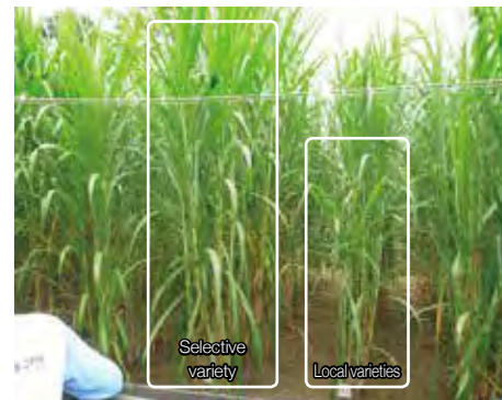
A Napier grass cultivation test