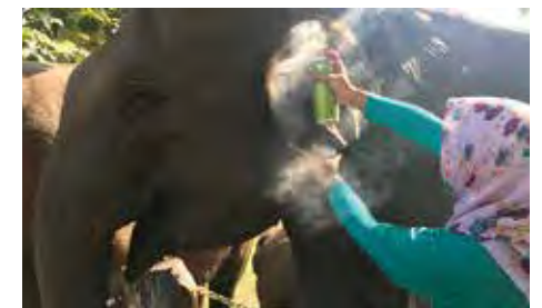
A veterinarian cares for eight elephants that are part of a patrol team