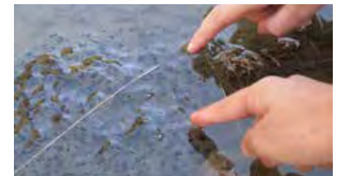
Observing montane brown frog egg masses