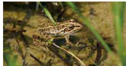
The Japanese pond frog is an important species for the regeneration of yatsuda paddies