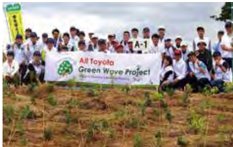
The fourth “Connecting” Activity: The Millennium Hope Hill Tree Planting Event in Tohoku

In the future, the activity areas of All-Toyota programs will be expanded and “connecting” activities will be undertaken such as preserving living creatures that is common to multiple areas.