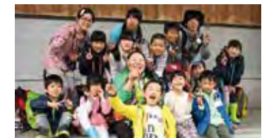
Children participating in the program and university students participating as interns

Inquiries from non-local administrative officials, NPOs, and companies, with which there were no prior ties have increased and networks are expanding, leading to new activities.