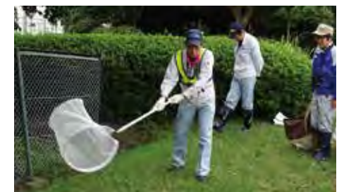
Plant employees conduct surveys of living creatures