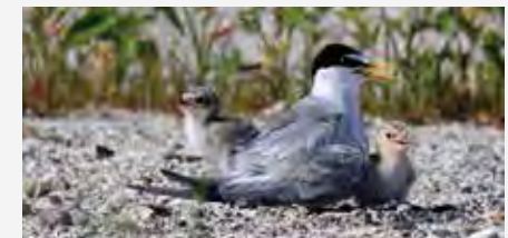
Parent and chick little terns