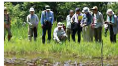
An observation tour

We will continue to conduct environmental education programs that use dragonflies as inspiration to learn about nature in our immediate surroundings and lead to action.