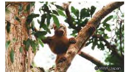
Orangutans are endangered due to the rapid loss of forests

■ FY2018 Activities (2): A website for the Living Asian Forest Project in both Japanese and English was launched in November 2017. The site introduces a summary of the project as well as information on recent activities, plants and animals inhabiting the living Asian forests.