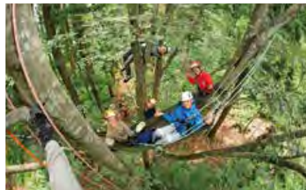
Children participating in the Hakusan Outdoor Journey program

Toyota Shirakawa-Go Eco-Institute will continue to develop new hands-on nature programs to nurture an awareness of living in harmony with nature among a growing number of adults and children.