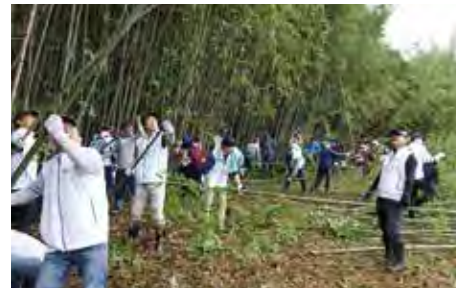
The fifth “Connecting” Activity: Logging of Yahagi River bamboo forest