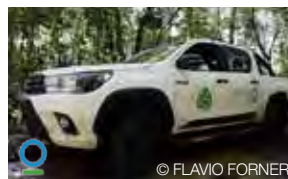
Local use of Toyota vehicles

■ FY2018 Activities (3): Environmental NGOs BirdLife International (BLI) and Conservation International (CI) conduct IUCN Red List surveys and preservation activities. Toyota has been supporting activities for the Red List and has provided vehicles to the two organizations since 2016. Based on local needs, in FY2017, Toyota made donations to BLI in Vietnam and Brazil and to CI in Indonesia and Brazil, supporting local surveys.