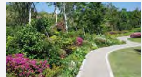
The biodiversity zone at the Tajimi Service Center