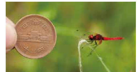
The scarlet dwarf is about 2 centimeters long