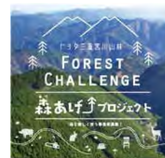
The Forest Challenge

* Water conservation: The ground penetration and storage of rainwater that slowly flows as underground water and rivers