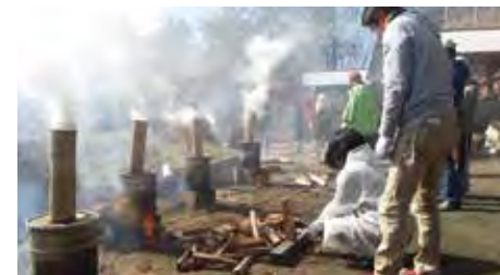
Bamboo charcoal making using pail cans

In March 2018, we conducted a program on making charcoal from bamboo and searching for spring living creatures in satoyama. The objective was to inform participants about earlier lifestyles in satoyama, which used natural resources cyclically, and raise awareness about current satoyama issues. Members of the Nukata Charcoal Making Group, a member organization of the Shimoyama Satoyama Conference, demonstrated bamboo charcoal making techniques using pail cans and discussed uses for charcoal in daily life. Participants learned about damage caused by animals and one of the solutions is to hunt and eat. They tasted a lunch of wild boar stew prepared by local mothers. During the search for living creatures, participants learned about the various environments of satoyama and the many creatures inhabiting them by finding signs of living creatures in forests and grasslands, and observing egg masses of montane brown frogs in rice paddies.